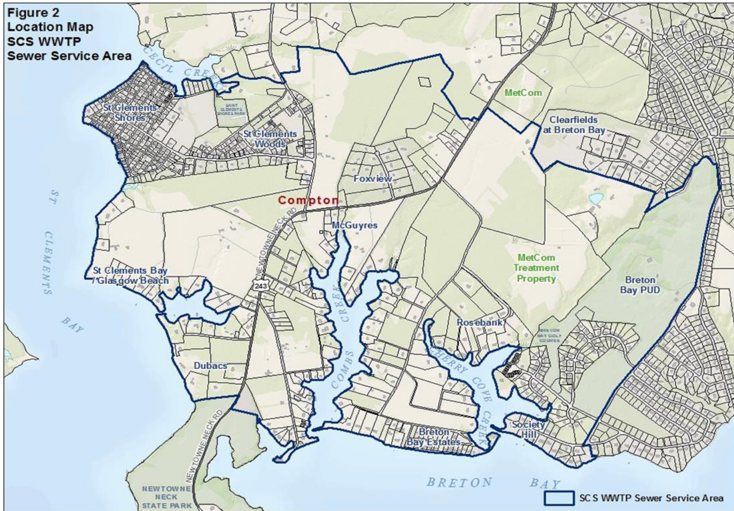
Figure 2 Location Map SCS WWTP Sewer Service Area