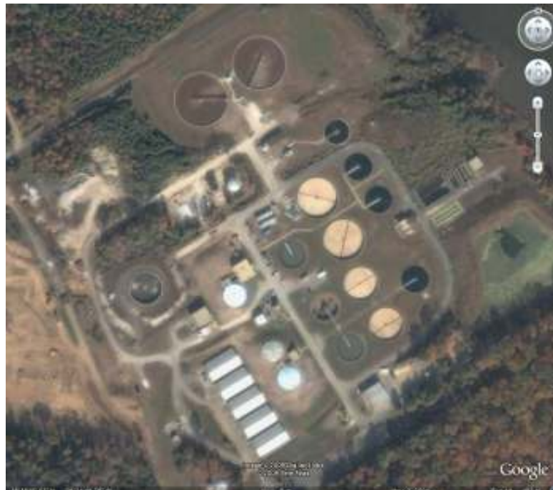
Aerial view of the Marlay-Taylor Facility located at 48020 Pine Hill Run Road, Lexington Park, Maryland

The Marlay-Taylor Water Reclamation Facility (MTWRF) is the largest treatment plant operated by MetCom and serves the Lexington Park, Hollywood and Piney Point areas of St. Mary's County. The plant is currently designed to treat 6.0 million gallons of sewerage per day. The flow to the plant is currently 3.3 million gallons per day; so a little less than half of the plant's capacity remains available for growth in the community.